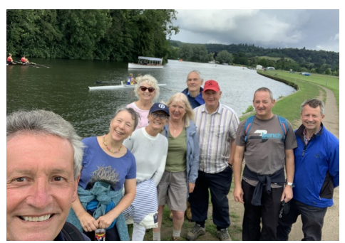
The Happy Ramblers

On Sunday 4 July a group of nine of us met up at the small Victorian Gothic church at Remenham to follow the Thames Path from Remenham to Aston and back through the fields of the Greenlands Estate. Our numbers were unfortunately reduced due to a number of our party unable to get past a boat that blocked Church Lane and so were left high and dry!