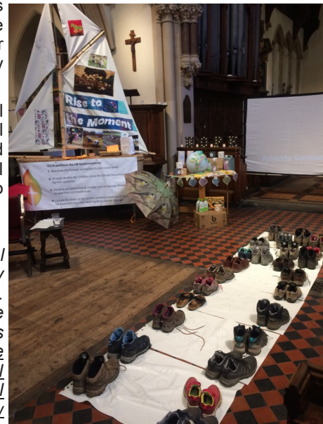
Reading Minster - Boat & Boots

"I used to think that the top global environmental problems were biodiversity loss, ecosystem collapse and climate change. I thought that with 30 years of good science we could address these problems, but I was wrong. The top environment problems are selfishness, greed and apathy, and to deal with these we need a spiritual and cultural transformation. And we scientists don't know how to do that."